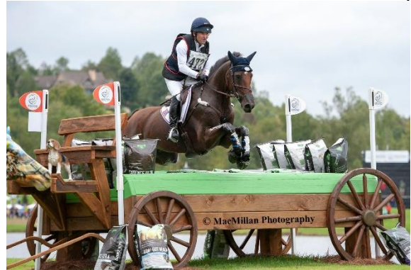
American Phillip Dutton on the cross-country course at WEG.

I chose arena design, mascot groom and spectator surveys and while I will say they all sounded interesting, I didn't for various reasons get to do any of those things. This is when being flexible and versatile when you are a volunteer at such a function comes into play.