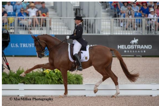
German Isabel Werth won Gold at the World Equestrian Games

Following my experiences at the World Cup, I made the choice to volunteer for the 2018 WEG mostly because I knew the advantages of volunteering and saw for myself how much "back stage access" you are allowed. These events give you free all-event access, food and parking during the event which saves you money - all you have to do is get there. WEG also provides housing for those volunteering over a period of time, local residents open up their homes, and churches provide blankets and pillows to the hostel-type housing. I met two young, 20-something ladies from Australia who were working a Reining event. I asked them if they did Reining back home and they informed me that they are Event riders and were working the Reining event during an Eventing day off. They planned on staying the entire 3 weeks working multiple disciplines. I would have loved to have been able to do that in my twenties! I'm here to tell you that everyone can volunteer - everyone has skills.