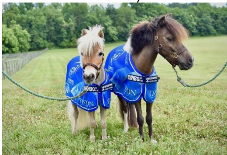
WEG mascots, Huck and Finn

I chose arena design, mascot groom and spectator surveys and while I will say they all sounded interesting, I didn't for various reasons get to do any of those things. This is when being flexible and versatile when you are a volunteer at such a function comes into play.