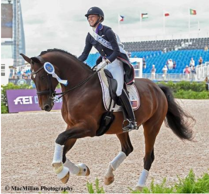
American Laura Graves wins silver at WEG on her horse, Verdades.

Shopping was copious and varied. Volunteers were given discounts at many of the vendors shops. The usual Land Rover Test driving course was set up on the 100 ft. section of mountain, carved away for the TIEC. It was up and running and even though I seriously wanted to test drive it, I did not want to go only 5 MPH around the course. And if you liked and missed riding your own horse, you could schedule a lesson on the mechanical horse for a price.