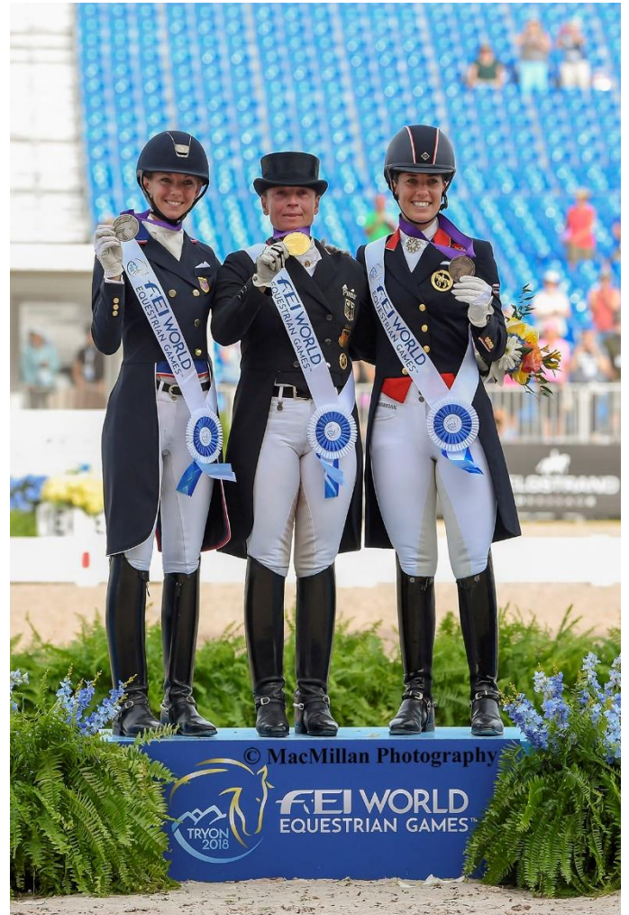
Queens of the Sandbox: Isabel Werth, Laura Graves and Charlotte Dujardin took the top three spots in Dressage at WEG.

So, I guess my next step in my volunteering journey is the Olympics! Believe me, the planning has already begun!!