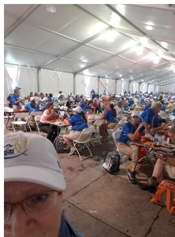
The volunteer tent

The World Cup was different from the WEG in that the organizers assigned your positions. Key ideal volunteer positions, in my opinion, were filled far in advance including scribing for the Dressage events. I can imagine it would be exhilarating and scary all at the same time to scribe at that event. I did notice that some scribes were actual judges or "professional scribes" which I didn't realize even existed. My assigned duties at the World Cup were to spend time with local school children in the "kid's zone," an interactive educational area specially created for the kids. I also assisted in the stabling area checking in and out horses and riders from the schooling arena. Believe me, this is a serious position and you even work under a FEI Veterinarian. Shopping was wonderful and much like events in Europe, the schooling arena was essentially in the middle of the vendor and food court so you could sit and eat your lunch, have a beer or shop and rub shoulders with the likes of Steffen Peters, George Morris, Edward Gal and even "Big Bang Theory's" Kaley Cuoco, who is an avid equestrian.